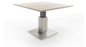
moveable table top