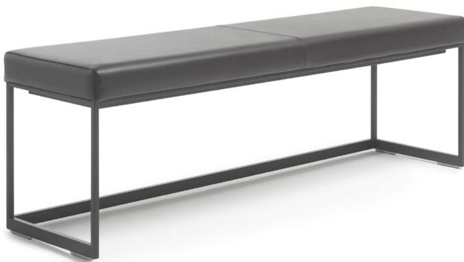
208 0140 8 81 11 (Item no.) Squat bench 140 cm: 208 0140 Metal frame: stainless steel lacquered 8 Powder coating colour: choco 81 Seat pad: leather choco 11