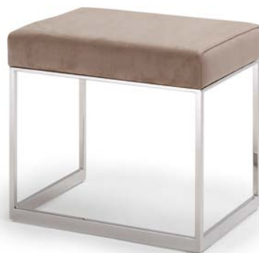
203 0050 1 02 (Item no.) Squat stool: 203 0050 Metal frame: stainless steel polished 1 Seat pad: microleather light brown 02